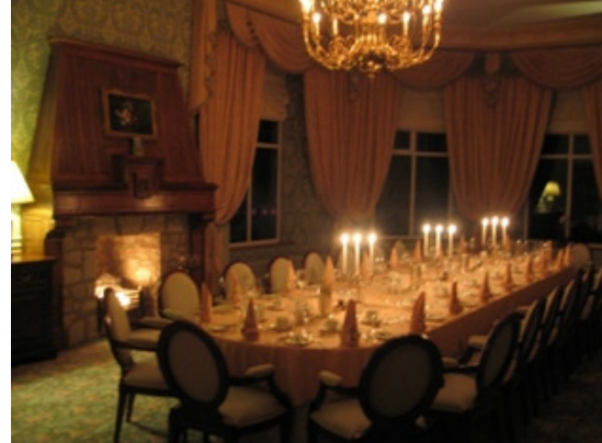
Britannia Banqueting Table