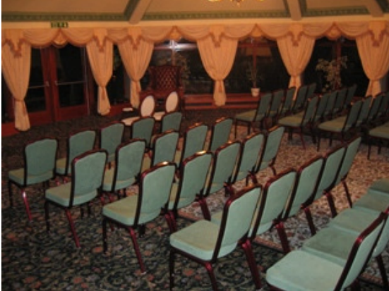
Conservatory Wedding Ceremony Set up