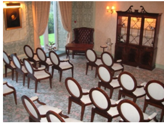
Capel Coch Suite Wedding Ceremony Set up