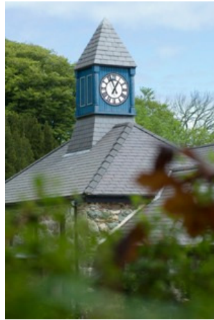
Clock Tower Café Wine Bar and Spa Reception

Built in 1882, originally as a grand country mansion the hotel has a reputation for superb cuisine and fine wine and was awarded the prestigious Cheshire Life, North Wales - Food & Wine Award for 2004. It is now considered to be one of the finest Country House hotels in Wales. Tre-Ysgawen Spa was one of only three finalists in the Professional Beauty 'Hotel Spa of the Year Awards 2005' and are current winners of Cheshire Life Food & Wine for North Wales 2008