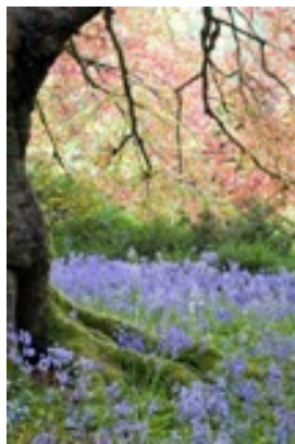
The tranquil and beautifully maintained gardens of Tre-Ysgawen Hall provide the perfect backdrop for those memorable Wedding Day photographs