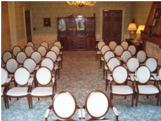
Britannia Suite Wedding Ceremony Set up